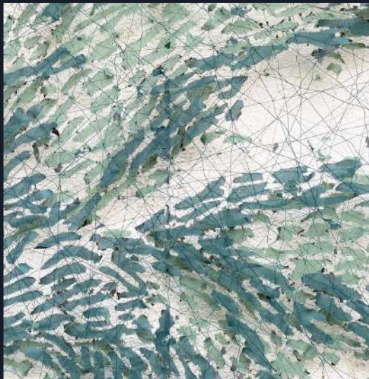
EAU DE NIL, 2021 Cotton fabric 62 x 47 inches INR 3,50,000 + 12% GST